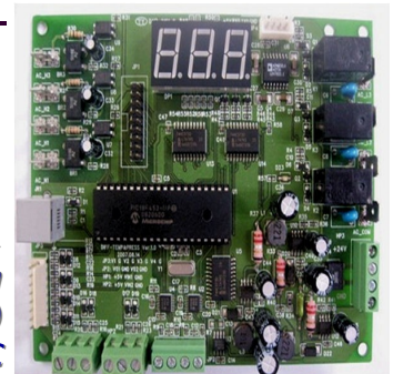
The H.E.L.P. System Smart Controller has no restrictive programming!

PID/PLC Systems require programming or tuning of process parameters in the control loop. Because of this manual tuning process, PID/PLC control systems are a compromise between programming costs and control efficiency. While it is possible to program a PID/PLC process loop that accommodates most scenarios, it soon becomes economically impractical (Expensive) to define and dictate all of them as each specific implementation of a PID controller requires individual tuning. PID/PLC control systems are based on process emulation and have no direct knowledge of the process being controlled. Even when a PID control is implemented in a digital controller, it attempts to replicate a static analog system. This analog control was a great step forward in the days before affordable microprocessors; but is now only as "Smart" as the pre-defined constraints and limits the programmer incorporated into the controls protocol.